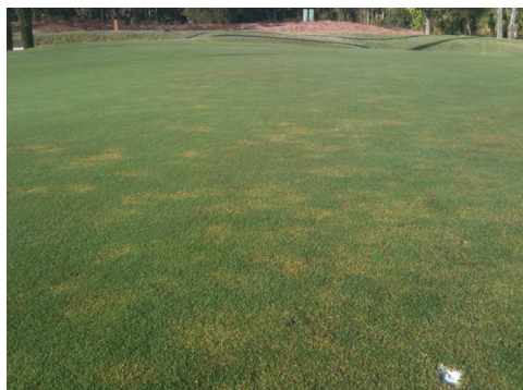
Nematodes damage on bermudagrass greens