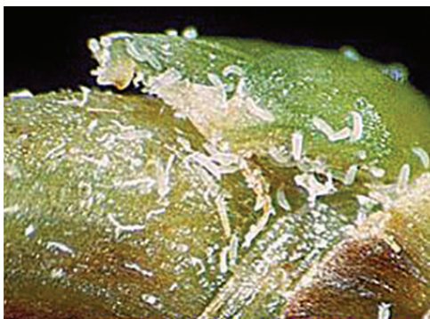
Microscopic view of bermudagrass mite at leaf bases